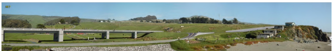
PROPOSED GLEASON BEACH BRIDGE BEFORE AND AFTER