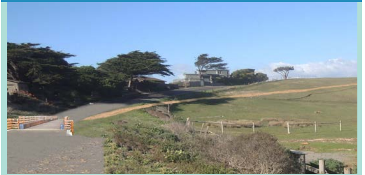
Proposed California Coastal Trail Extension

Where: Bodega Bay Grange Hall, 1370 Bodega Avenue, Bodega Bay, CA 94923