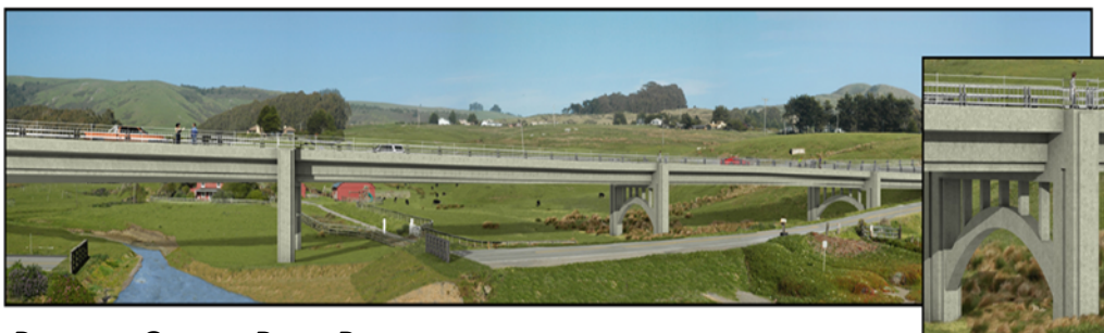
PROPOSED GLEASON BEACH BRIDGE