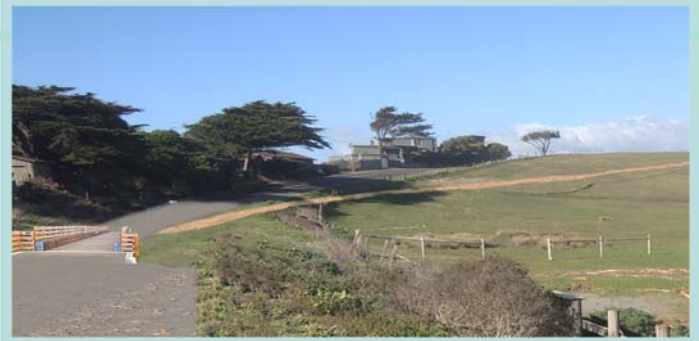
Above: Proposed California Coastal Trail Extension

The application is No. 2-18-0078. The public is invited to submit comments to NorthCentralCoast@coastal.ca.gov