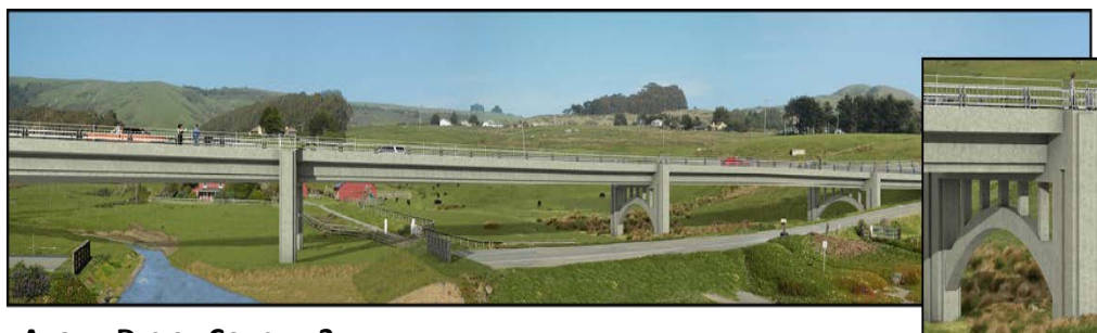
ABOVE: DESIGN CONCEPT 3